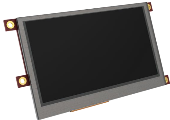
The uLCD-43 Display Module